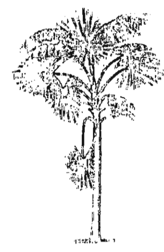
Thatch Palm Coccothrinax argentea

in the Caribbean. During the Spanish and French ownership of St. Croix. little colonization or agriculture occurred on St. Croix. However, the dense forests attracted teams of woodcutters who harvested the dense forests for ship repairs, and for timber to export to other islands. However after 1696 the French virtually abandoned St. Croix.